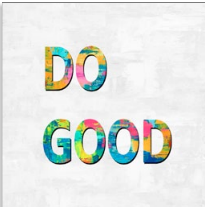
JMD117582 Jamie MacDowell Do Good in Color