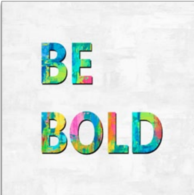
JMD117570 Jamie MacDowell Be Bold in Color