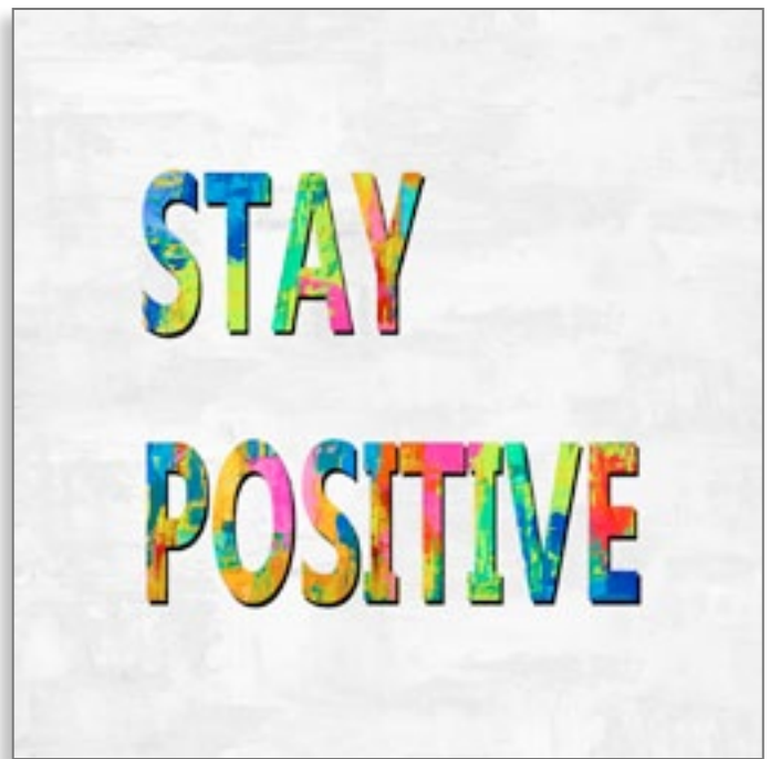
JMD117589 Jamie MacDowell Stay Positive in Color