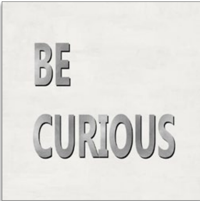
JMD117593 Jamie MacDowell Be Curious