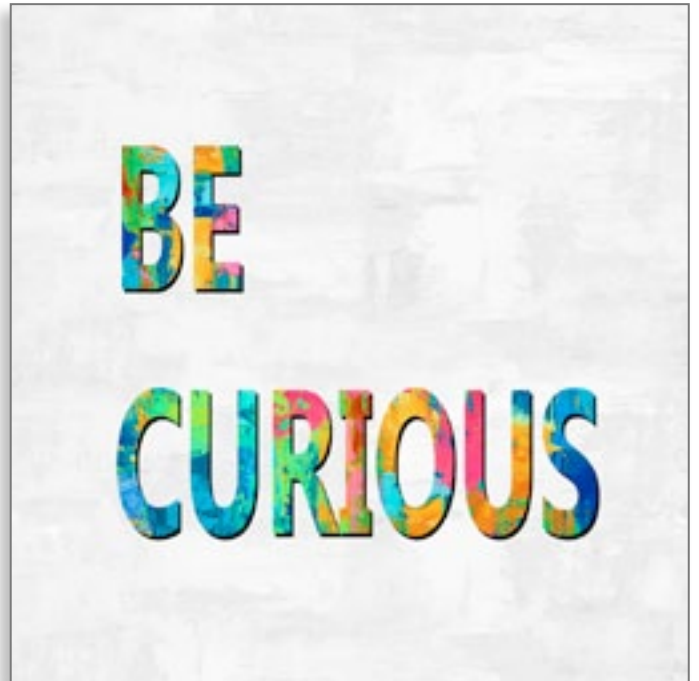
JMD117571 Jamie MacDowell Be Curious in Color